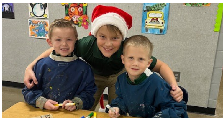
6th Graders helped their Kindergarten buddies with a project in art class