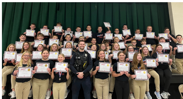
6th Grade DARE Graduation ceremony