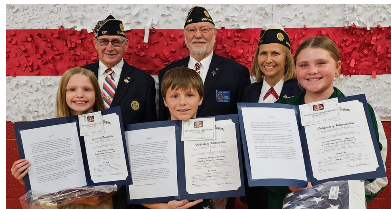
Veterans Day Celebration with American Legion Post #137